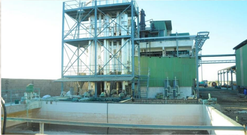
MEE Machine for Zero Discharge